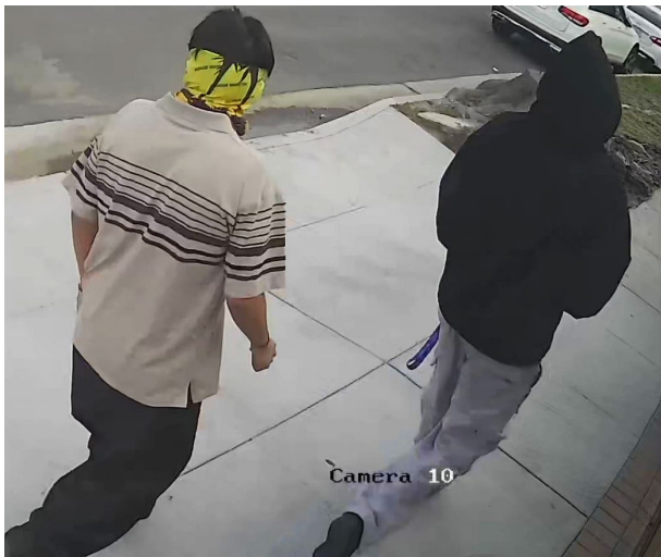
The U.S. Postal Inspection Service is offering a reward of up to $150,000 for information leading to the arrest and conviction of the suspects who robbed a United States Postal Service (USPS) letter carrier.

The incident occured at approximately 2:35 p.m., on January 19, 2024, near 13142 Hart Street, North Hollywood, CA, 91605.