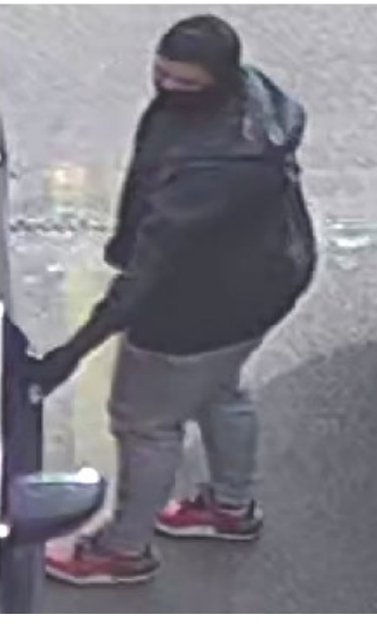
The U.S. Postal Inspection Service is offering a reward of up to $100,000 for information leading to the arrest and conviction of the suspects responsible for ongoing incidents involving the vandalism of U.S. Postal Service delivery vehicles and the subsequent theft of mail.

These suspects are known to operate in the Loop area of Chicago in teams of three to four individuals and drive stolen vehicles. The suspects are believed to be younger males wearing face masks and dark clothing. The suspect pictured above, is believed to be in his early-20s and is typically the driver of the suspect vehicle. His height is estimated between 5'10" and 6'2" and he has a large build.