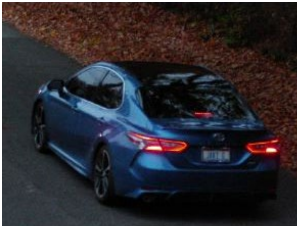
Vehicle immediately after the robbery