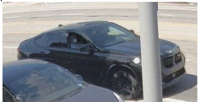
Actual suspect vehicle pictured above

The U.S. Postal Inspection Service is offering a reward of up to $50,000 for information leading to the arrest and conviction of the suspect(s) who robbed a USPS letter carrier at gunpoint. The robbery occurred on July 11, 2023, at approximately 10:20 a.m., near 5522 Vineland Avenue, North Hollywood, CA, 91601.