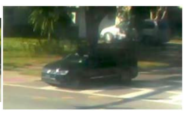
The U.S. Postal Inspection Service is offering a reward of up to $50,000 for information leading to the arrest and conviction of the suspect(s) who robbed a United States Postal Service (USPS) letter carrier at 641 Altamira Circle, in Altamonte Springs, FL 32701. The incident occurred at approximately 4:30 p.m., on Friday, January 27, 2023.

The three (3) suspects are described as Black males, in their 20s, approximately 5'8" in height, slim builds, wearing grey sweaters and black masks. They fled in the vehicle pictured above which was bearing a Texas license plate.